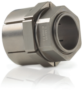
Performance Data Table