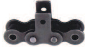
SK-1/M1 双侧 (both sides)