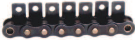
SA-1/M1 单侧 (one side)